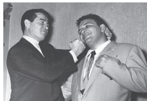
Friends don't fight? Rocky Graziano pretends to hit his buddy Jake LaMotta.