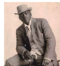
Jack Johnson, one of the all-time greats. But he refused to give Langford a shot at his title.